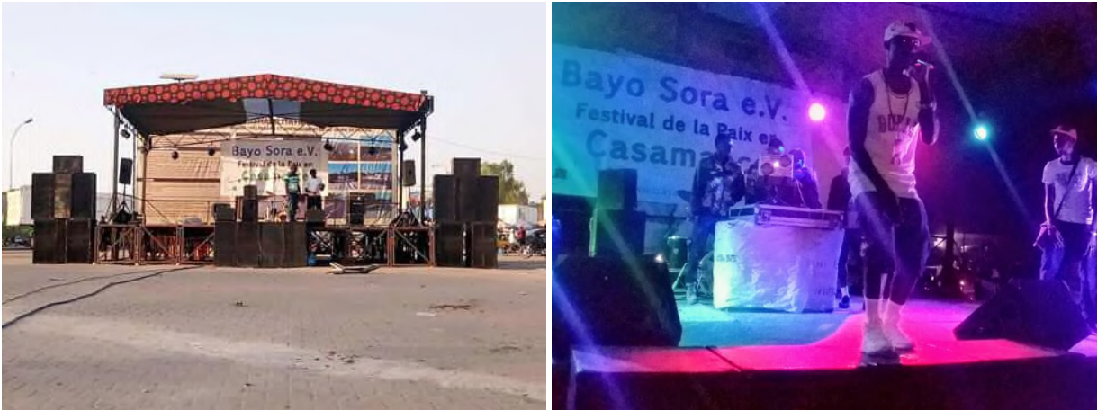
Figure 12 Festival stage on Place Alioune Sitoé Diatta in Ziguinchor / artists on stage

From Friday to Sunday, starting around 6pm, local and international artists performed at the large stage at the Place Sitoé Diatta .