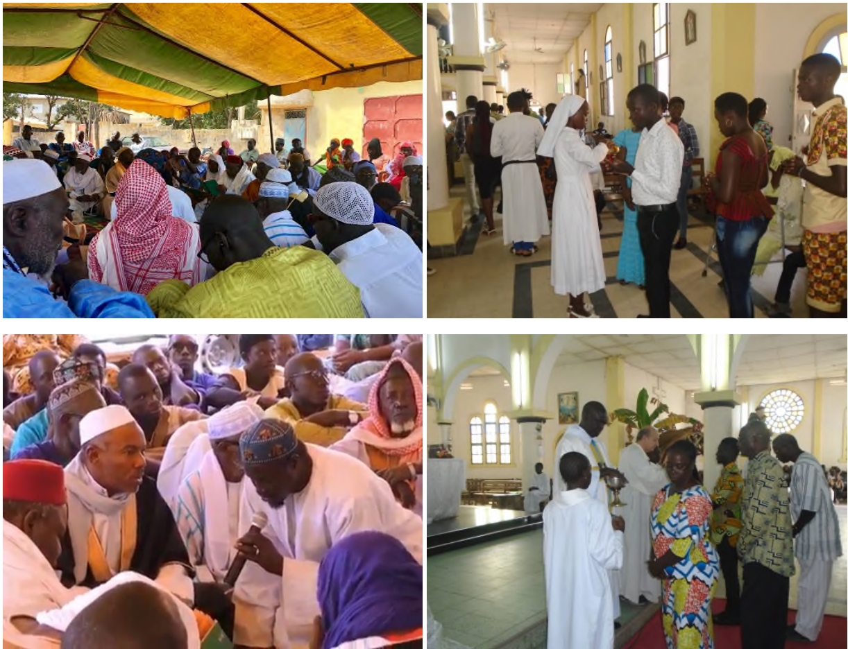
Figure 1 Inter-religious prayers for peace and the success of the festival in Ziguinchor

The festival started this year again with inter-religious prayers involving all denominations. Muslims, Christians and representatives of nature religions prayed together for peace in Casamance and the world and for the success of the Peace Festival.